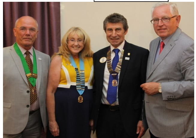
The DG Team 2016-7

I hope everyone enjoyed the Olympics and the amazing success of Team GB, Uttoxeter has been mentioned so many times on national radio and television of late, nothing to do with the Lions Club but that great competitor Adam Peaty, of whom the town is rightly very proud.